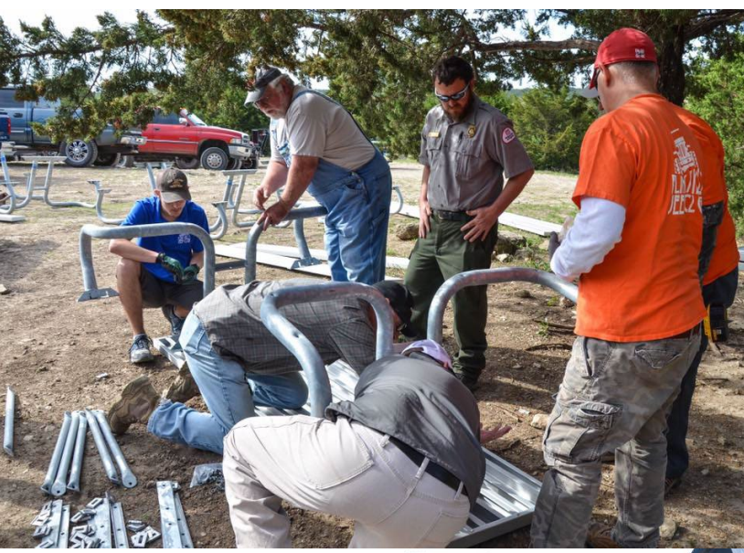
Working side by side Corps of Engineers staff and volunteers made this project come